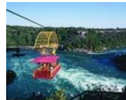
Whirlpool aero car